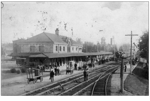
ABOVE , looking north to the 1857 station. Below, the present station in its early years.